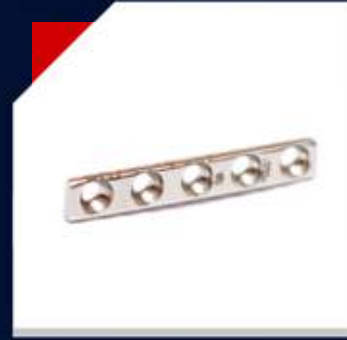
Straight Mini Plate 2.0mm