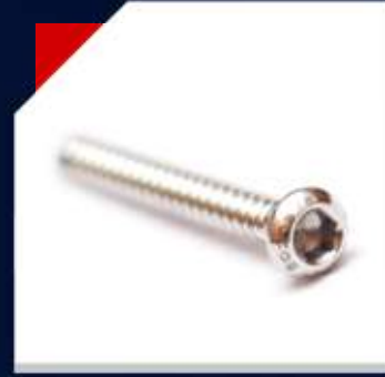
ø2.7mm Cortical Screw 1.0mm Pitch Self-Tapping Full Thread