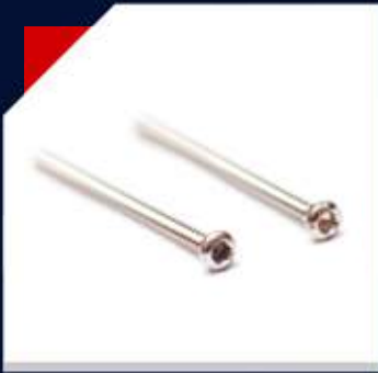
ø2.7mm Cortical Screw 1.0mm Pitch Full Thread