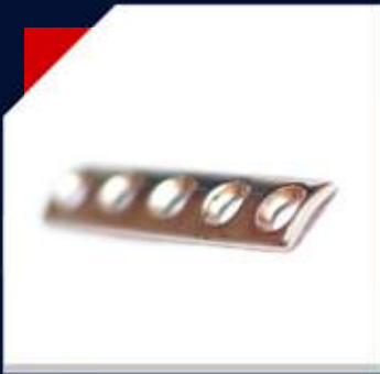
Quarter Tubular Plate 2.7mm