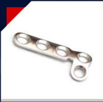
Epiphysis Mini Plates 2.7mm