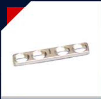
Self Compression Plates 2.7mm