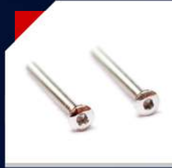
ø2.0mm Cortical Screw 0.6mm Pitch Full Thread