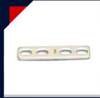
Self Compression Plates 2.0mm