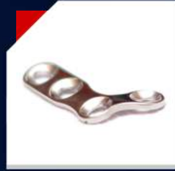
Epiphysis Mini Plates 2.0mm